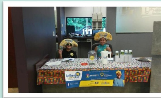
We raised $273.50 at the Anthem Lemonade Fundraiser with the help of some great kids!