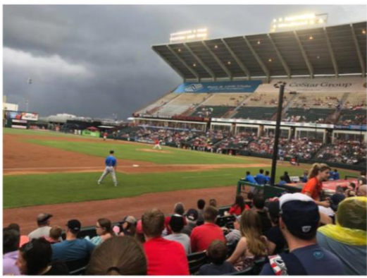
Family fun day at the Flying Squirrels game.